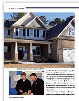
BACK (page 2)

Brochures are printed on high-quality paper and can be turned around in ten business days from the day you approve your brochure layout!