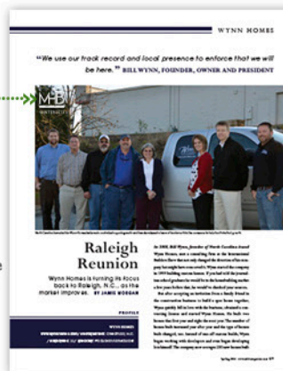
FRONT (page 1)