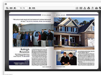
DIGITAL FLIP BOOK

Digital flip books can be placed on your website or emailed to new clients for unlimited use and take your message to the next level.